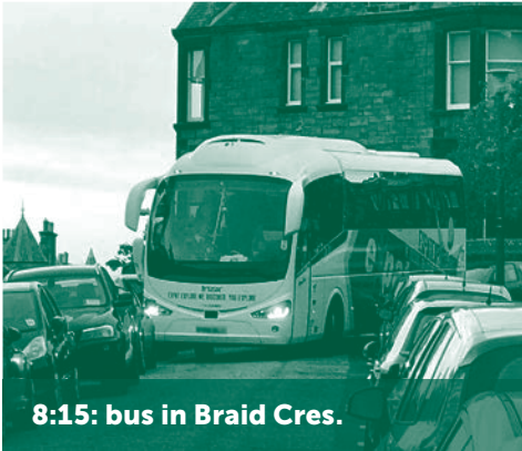
8:15: bus in Braid Cres.