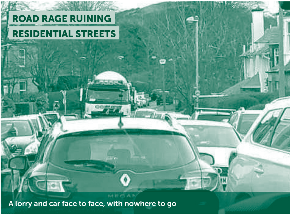
A lorry and car face to face, with nowhere to go

Cllr Main's new South Edinburgh Save a Street Campaign has a Facebook page for residents to comment on road safety. She reports 'Most days I receive at least one email about street safety, often with a photo or video - dangerous driving, near accidents, traffic stuck on narrow streets, lorries speeding down residential streets. Let's get these photos and videos into the public domain, so the extent of the problems is in plain view and up for discussion. Time to reclaim our streets'. www.facebook.com/SouthEdinSaveaStreet