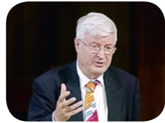
Representing you in Parliament (see page 8)