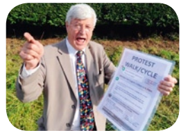
Victory- coal mine rejected (see page 7)