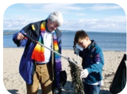
Marine Environment (page 7)