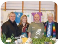
Transition Edinburgh South Eco Festival (see page 9)