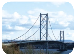
Fix the bridge, save billions (see page 11)