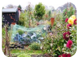
Get growing (see page 9)