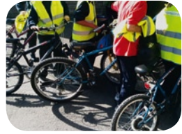
Pedal Power (see page 10)