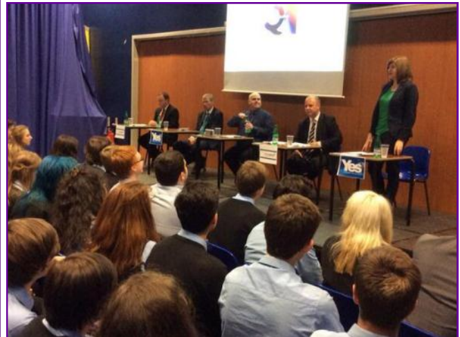
Speaking for Green Yes at Gracemount High